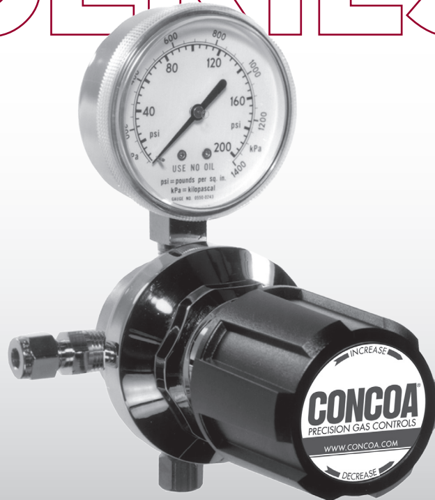
205 3021-000 shown