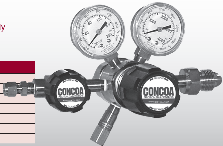
432 3331-580 shown